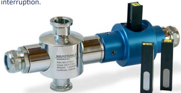
Integrated NIST validation accessory

The convenient range of small-footprint, zero dead-volume hygienic measurement cells that contain no electronics or moving parts are well suited for both ordinary and hazardous area installation. Standard NIST-traceable validation filters can be used to verify analyzer performance without process interruption.