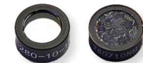
left: Optical filter used on a Kemtrak DCP007-UV photometer right: Eroded optical filter from a traditional hot mercury vapor lamp photometer

The proprietary dual wavelength, four channel measurement technique used in the DCP007-UV analyzer provides deep absorbance measurement to 5 AU using a 1 cm optical path-length. A range of shorter optical path-lengths allow for even deeper absorbance and optical density measurements.